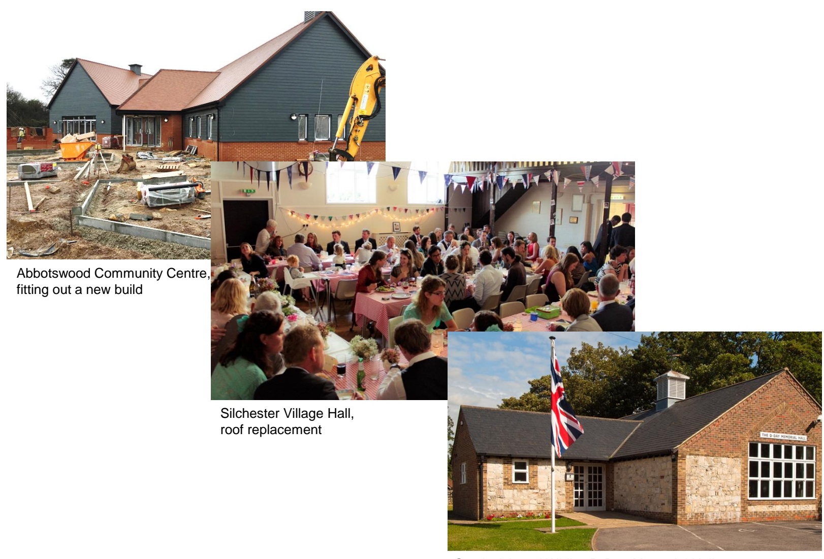
Southwick and Widley D-Day Memorial Hall, new doors and windows