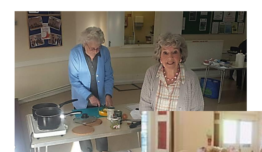
Cookery at Alamein Community Association, Andover